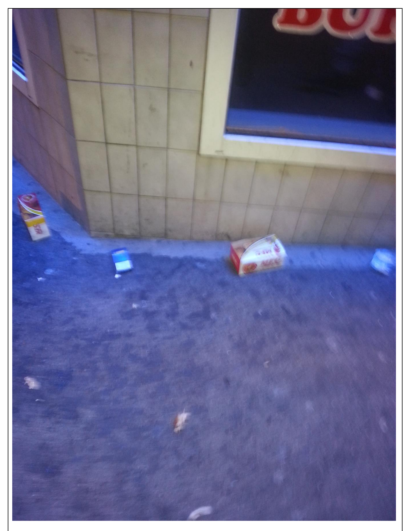
Photograph 3 Showing litter and food debris directly to exterior of Amir's store.