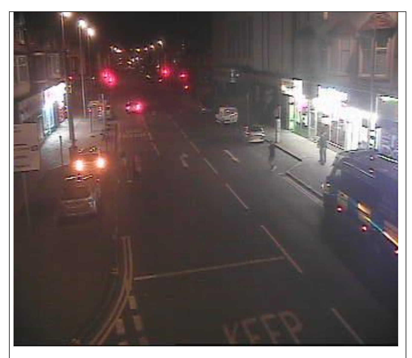
Photograph 6 Showing police on scene following disturbance of people on the street directly outside Amir's.

Scene observed as people arguing in doorway entrance by Council Officers.