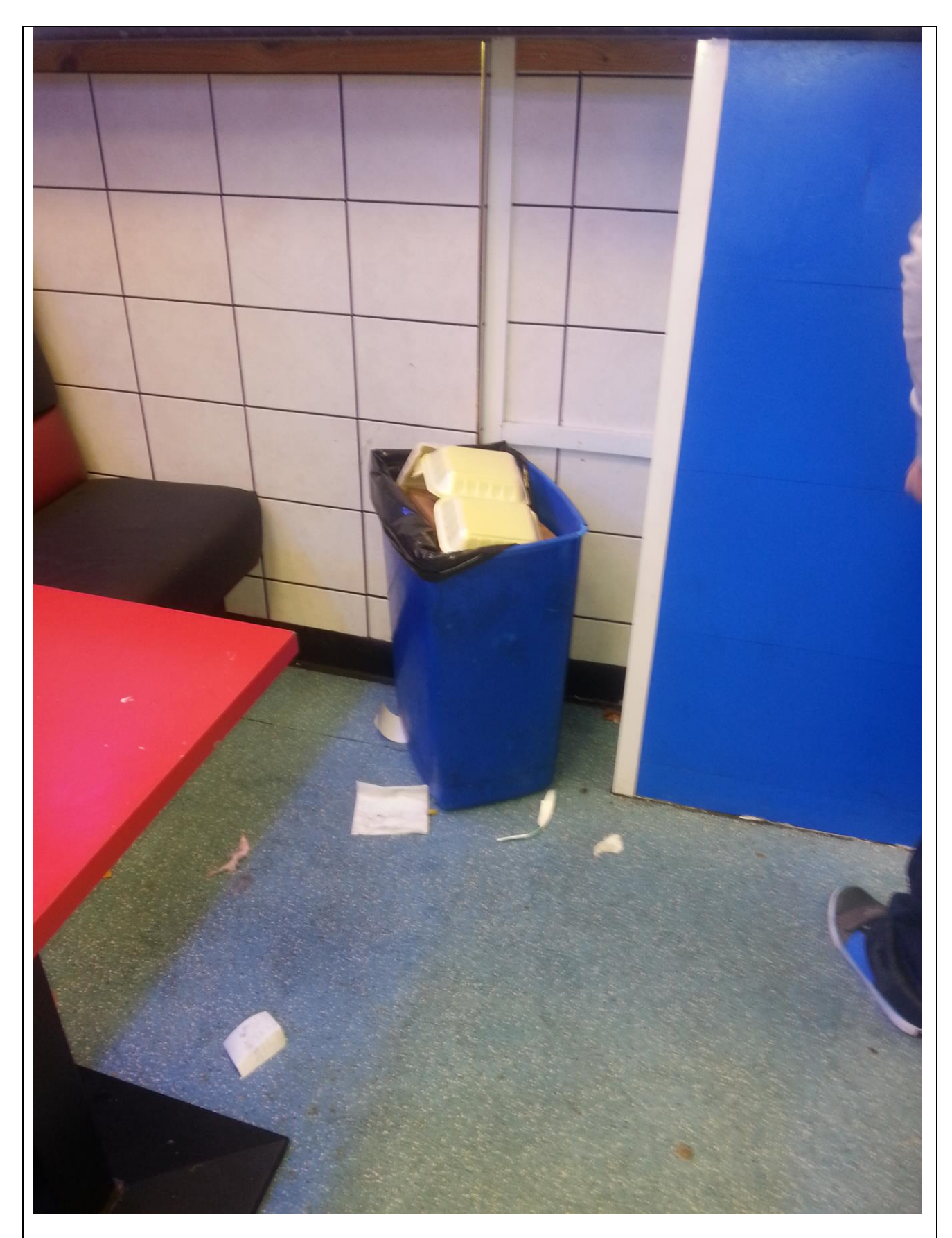
Photograph 5 second bins overflowing in Amir's store.