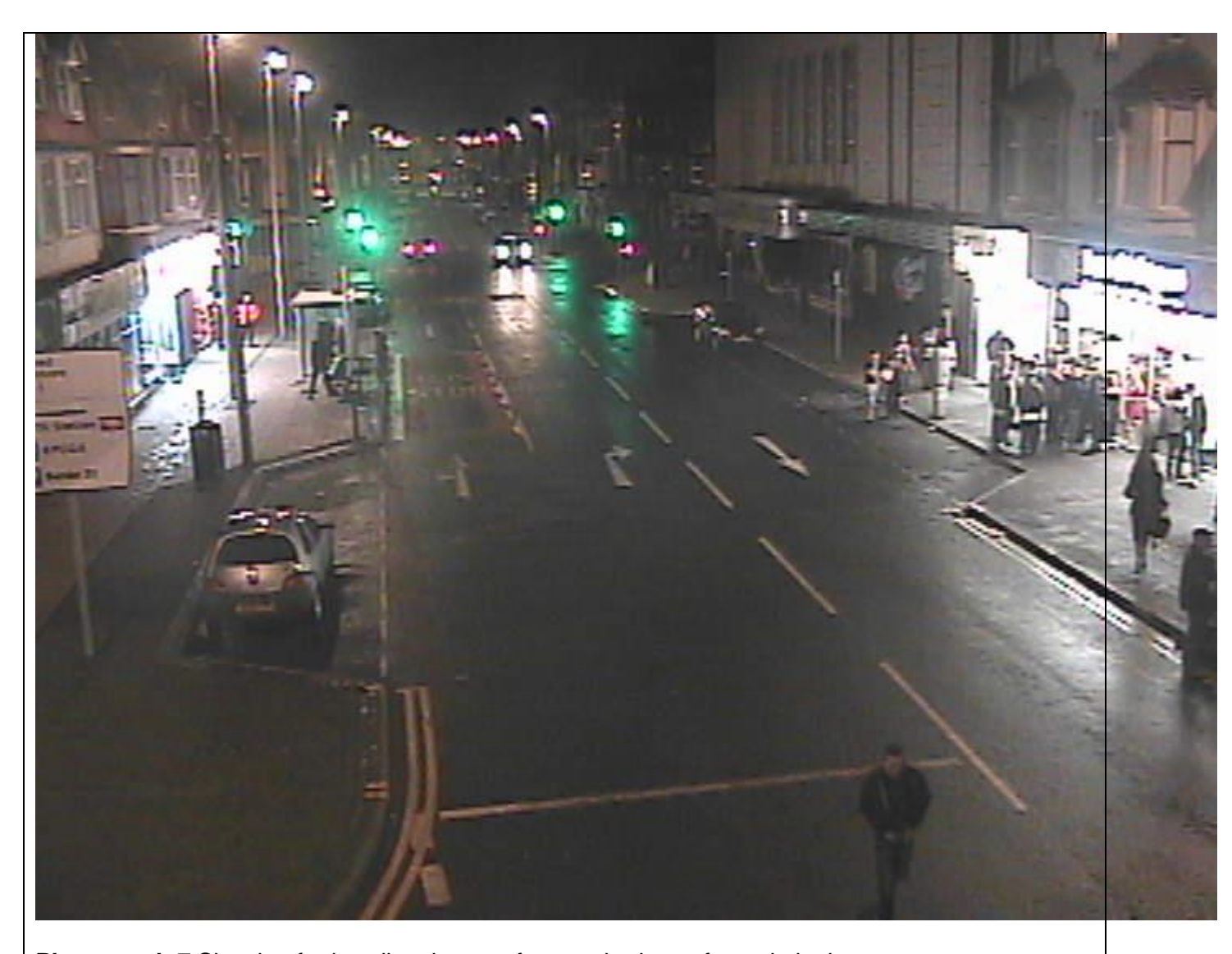
Photograph 7 Showing further disturbances from gatherings of people in the street.