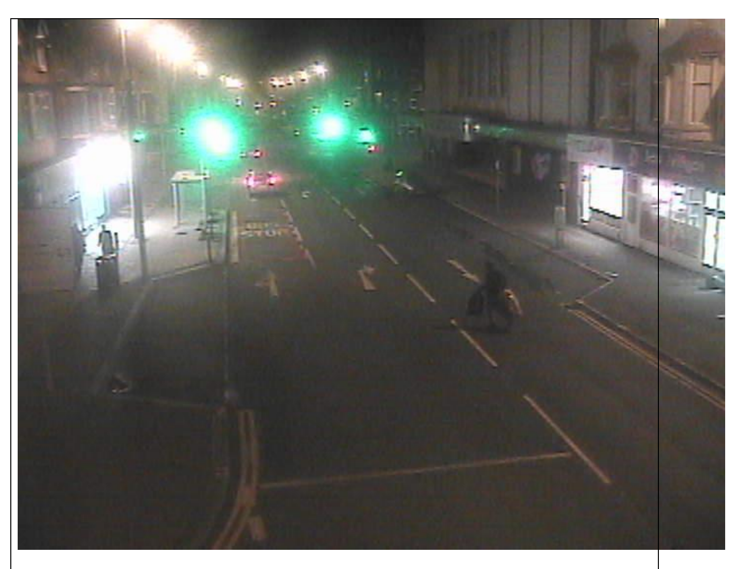
Photograph 2 of Mr Abdun again not using correct waste management attempting to cut costs by depositing black bags along with commercial waste receptacle.