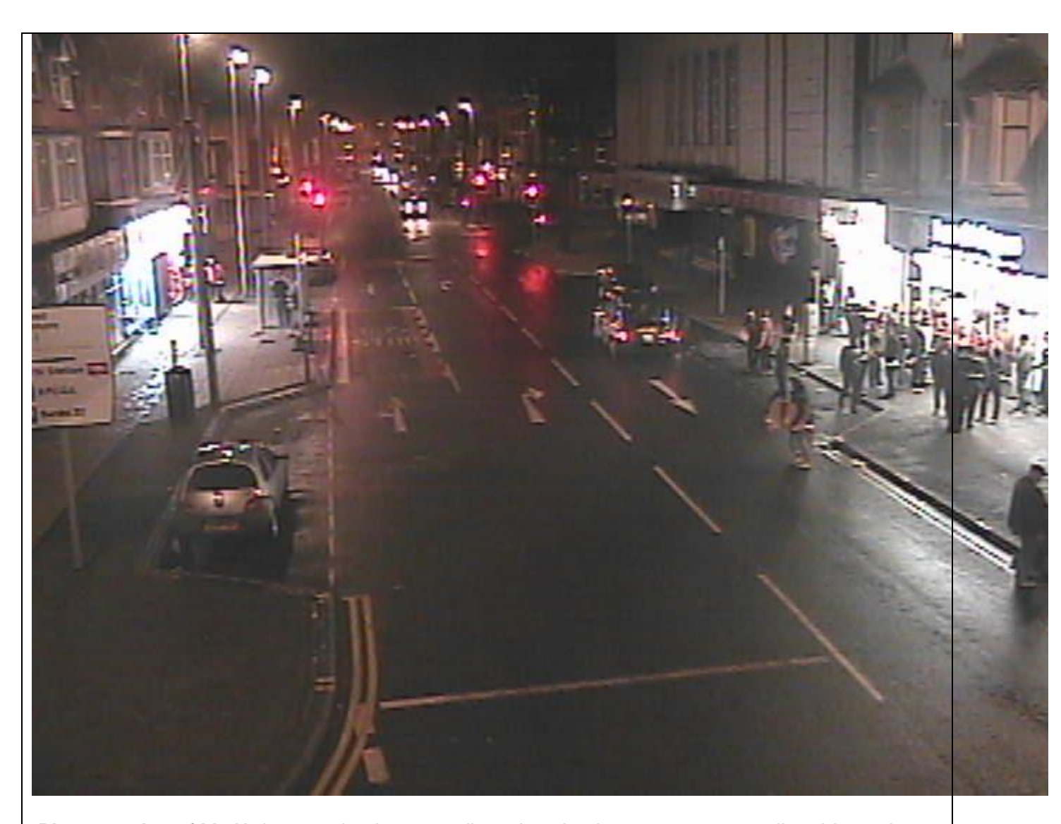
Photograph 1 of Mr Abdun carrying loose cardboard packaging across to street litter bin not in correct receptacle contrary to section 47 EPA 1990 (misuse of waste receptacles).